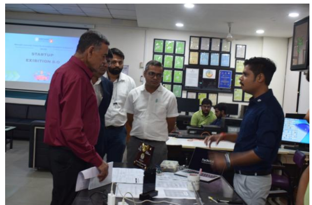
Glimpse of the some pitching movement of Startup Exhibiting to Experts